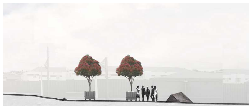
SECTION BB | SCALE 1:200 @ A3 Interim park

The bunds framing temporary tree nurseries located over historic building sites. Trees can be shifted to allow archaeological work to be carried out and reused in future permanent park.