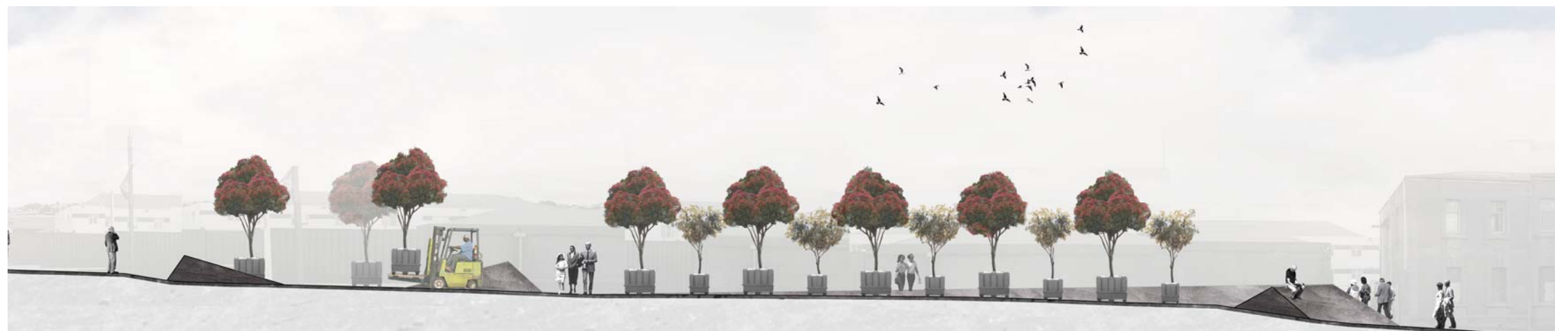
SECTION AA | SCALE 1:200 @ A3 Interim park

The existing surfaces are retained west of the Carillon with new asphalt bunds proposed to frame the edges of new temporary tree nurseries. New lawn and gravel paved memorial space aligns centrally to the Carillon axis.