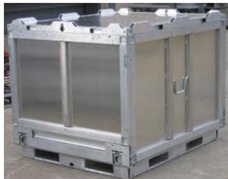
military type cases/containers