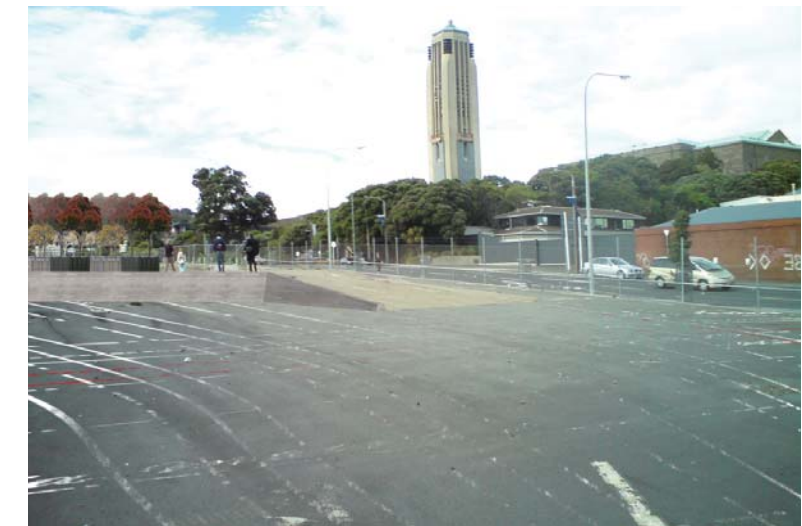
Perspective from north-west site corner at Taranaki St > Looking southeast toward the Carillon

Painted linework is proposed across existing asphalt surfaces interpreting the site history.