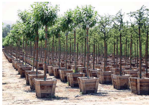
tree nursery / ward map (1891)