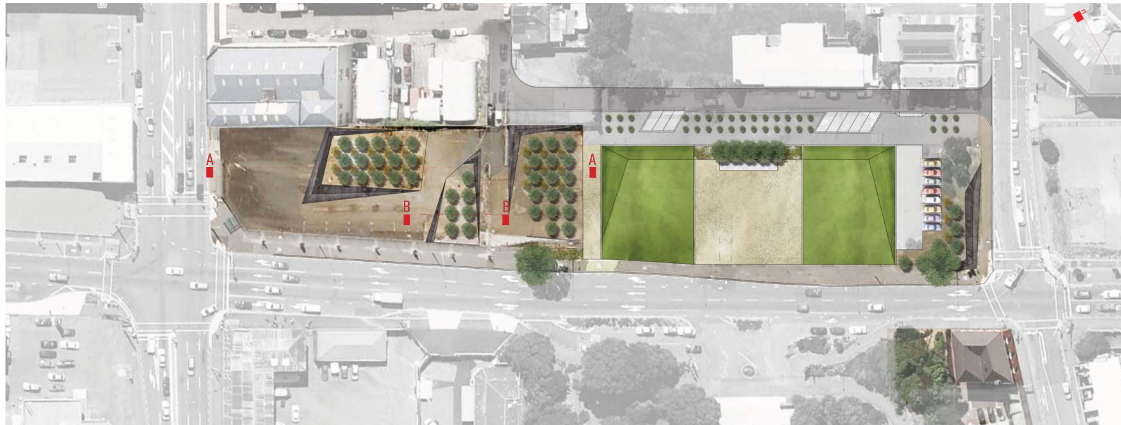
PLAN | SCALE 1:1000 @ A3 Interim park

The existing surfaces are retained west of the Carillon with new asphalt bunds proposed to frame the edges of new temporary tree nurseries. New lawn and gravel paved memorial space aligns centrally to the Carillon axis.